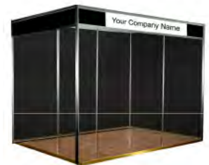
Image shows a 3m x 2m open corner booth (flooring not inc in package)

Note: Some booths will not have an end wall unless specifically requested.